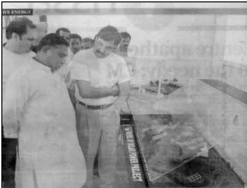
At the inauguration of the technology equipped power substation at Bhubaneswar on Sunday. ■ SDC